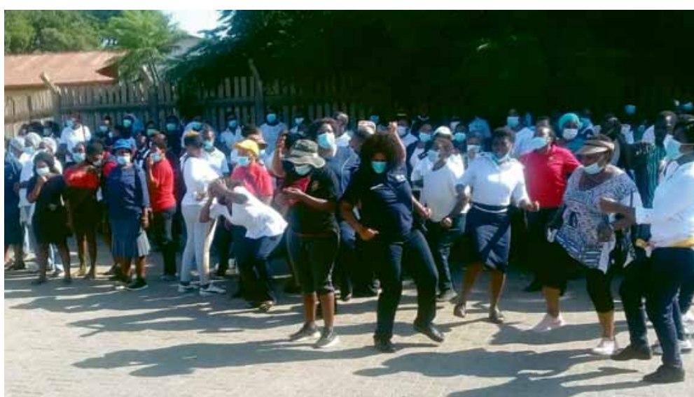
Philadelphia Hospital staff members picketing outside the hospital premises complaining about maladministration and poor working conditions.