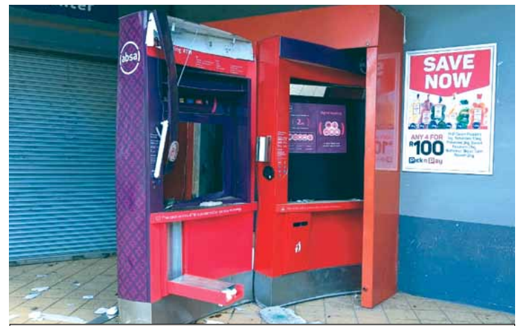
The wreckage of the ABSA ATM that was blasted at Moteti Top Spot Shopping Complex.